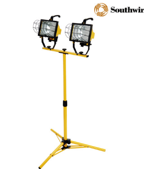
500W Dual Halogen Lamp with Stand #L14126