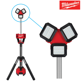
M18™ ROCKET™ Tower Light/Charger #2136-20