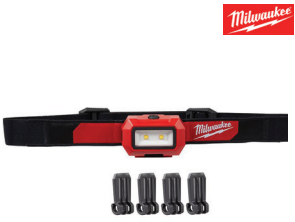
TRUEVIEW™ Headlamp w/ 3 AAA Batteries #2103M