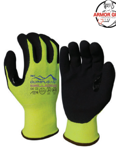
ExtraFlex Foam Nitrile Coated Cut-Resistant Gloves, ANSI A3, Vi-His Yellow