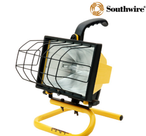
500W Halogen Work Light #L33