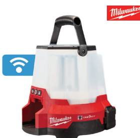
M18™ RADIUS™ Compact Site Light w/ ONE-KEY™ #2146-20