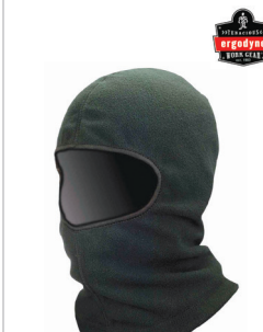
N-Ferno® Fleece Balaclava