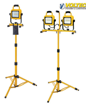
Single & Dual Head LED Work Light #V08-00733 - Single #V08-00735 - Dual