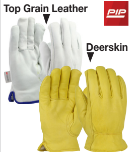
Thinsulate Lined Drivers Glove