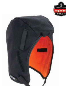
N-Ferno® 2-Layer FR Thermal Liner