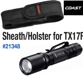
Sheath/Holster for TX17R #21348