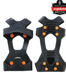
TREX Spike Ice Traction Device

Large #E16734 X-Large #E16735 2X-Large #E16736