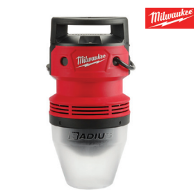
RADIUS™ LED 70w Temporary Site Light #2155-AC