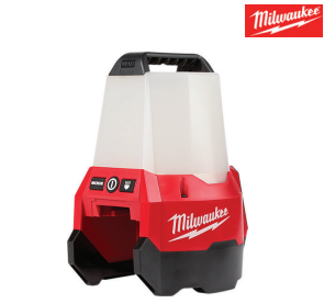
M18™ RADIUS™ Compact Site Light with Flood Mode #2144-20