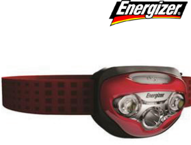
Contractor 3 LED Industrial Headlight w/ 3 AAA Batteries #HDBIN32E