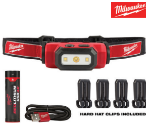
REDLITHIUM™ USB Hard Hat Headlamp Kit #2111-21