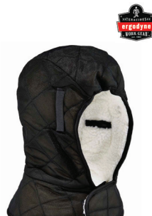
N-Ferno® 3-Layer Thermal Liner