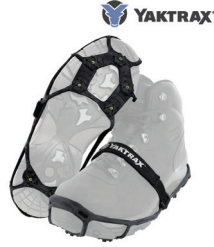
Ice Traction Spikes

Large #E16734 X-Large #E16735 2X-Large #E16736