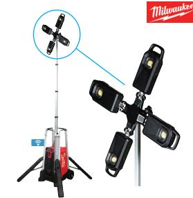
MX FUEL™ ROCKET™ Tower Light Kit • (1) MX FUEL™ REDLITHIUM™ XC406 Battery Pack #MXF041-1XC