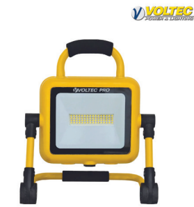
AC LED Work Light #08-00731 - 4,400 Lumens #08-00733 - 10,000 Lumens