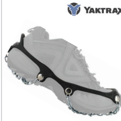
Ice Traction Chains

Small/Medium #08540 Large/X-Large #08541