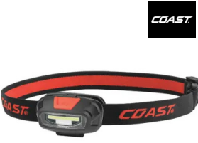
FL13 Headlamp 380 Lumen #21597