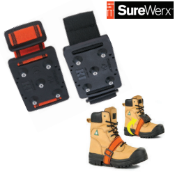
Mid-Sole Ice Cleat, Original Profile, One Size