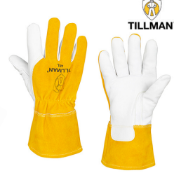
Fleece Lined Goat/Split Back MIG Glove