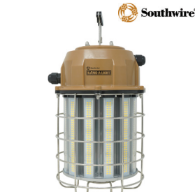
High Bay 150 W LED Temporary Area Lights #08-00405