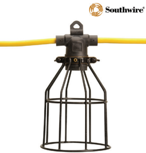
12/3 SJTW String Lights with Metal Cage #A9513-050-YW - 50 ft #A9513-100-YW - 100 ft