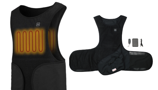
Boss® Therm™ Heated Vest Kit