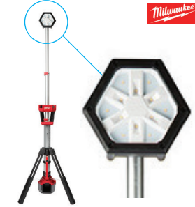
M18™ ROCKET™ Dual Power Tower Light #2131-20