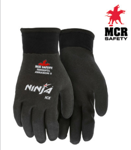
Ninja Ice Double Layer Winter Glove