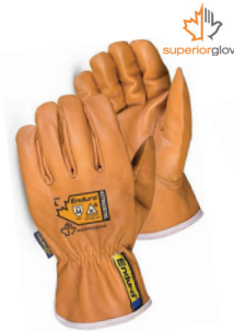
Endura® Goat Skin Driver's Thinsulate Glove