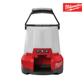
M18™ Radius Compact Site Light #2145-20