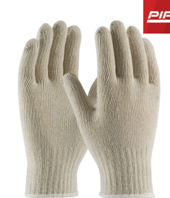
String Knit Glove