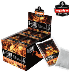
N-Ferno® 6990 Hand Warming Packets