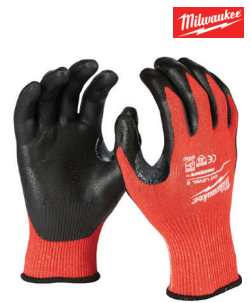
Cut Level 1 Winter Dipped Gloves