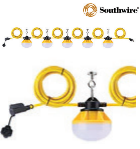
18/3 SJTW LED String Lights 08-00507 - 50 ft 08-00508 - 100 ft