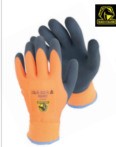
ANSI A2 Cold Weather Cut Resistant Glove