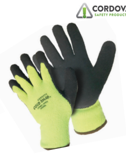
Cold Snap Winter Gloves