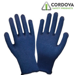
Thermostat Machine Knit Glove Liner