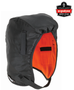
N-Ferno® 2-Layer Thermal Liner