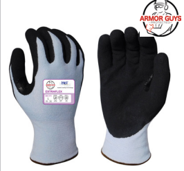
HCT Extraflex Winter Cut Resistant Glove